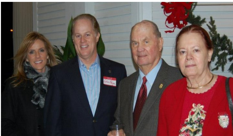
The Pages and Turners on the Crescent porch