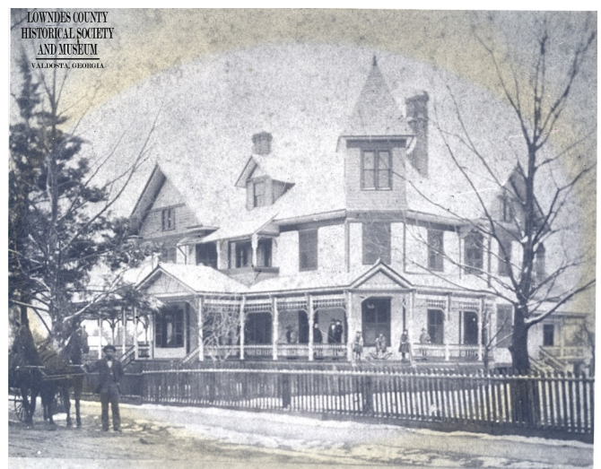
The Roberts House with a tower in the 1895 snow.