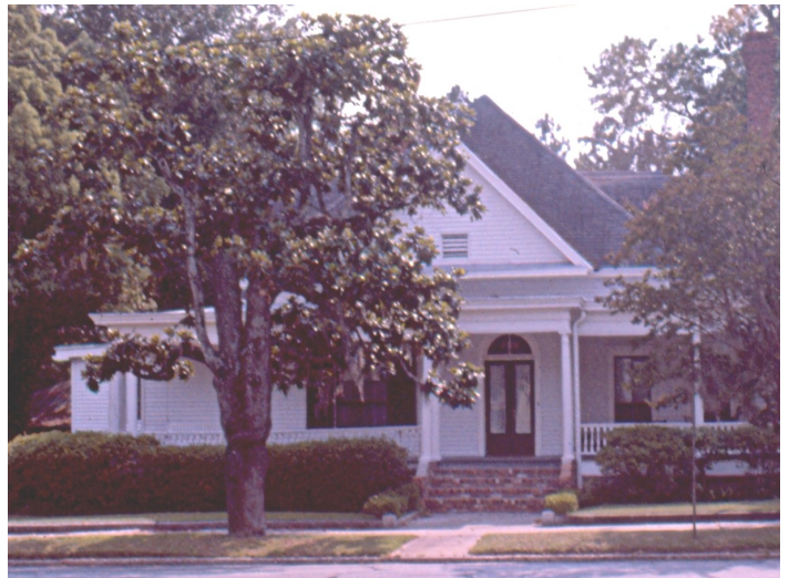
Tower-less 706 N. Patterson is presently Coggins & Wood Law