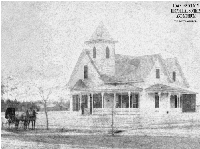
706 N. Patterson Street with tower soon after 1888 construction