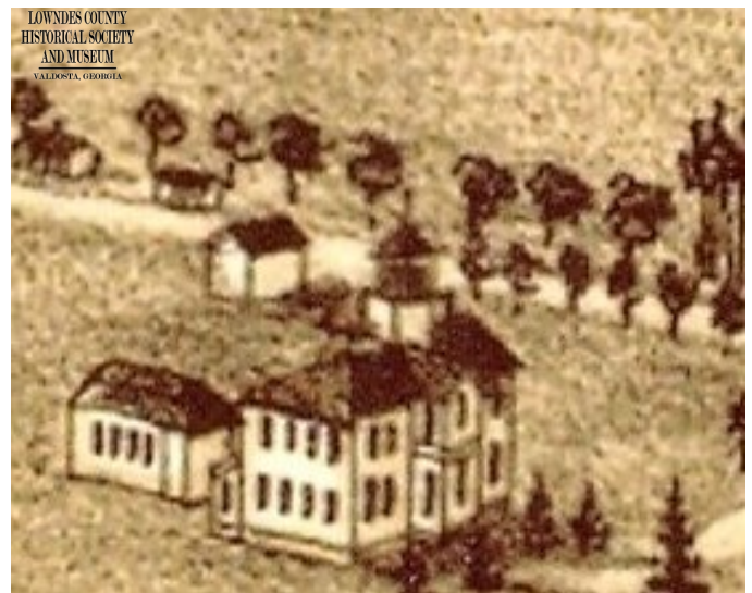
The Roberts House, then the Wells House, had no tower or large porches in the 1885 Panoramic View of Valdosta.