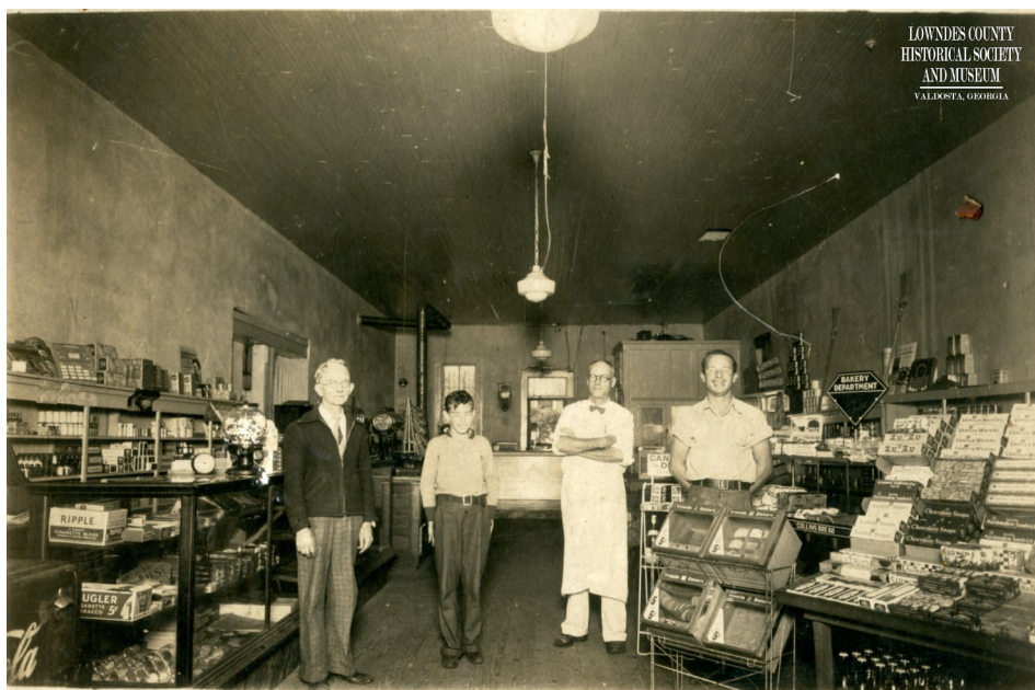
LOWNDES COUNTY HISTORICAL SOCIETY AND MUSEUM VALDOSTA, GEORGIA