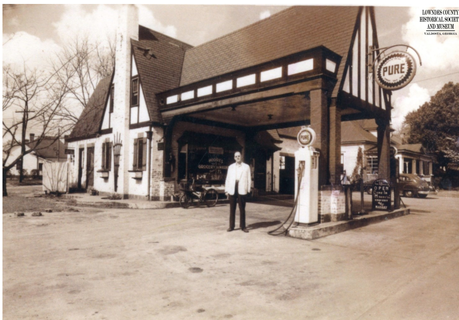
LOWNDES COUNTY HISTORICAL SOCIETY AND MUSEUM VALDOSTA, GEORGIA