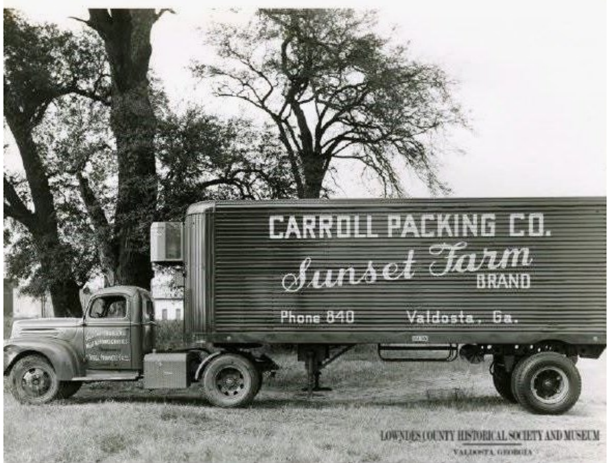
The above photo is dated January 12, 1948, 30 years after the beginning of Carroll farms supplying meat product and 70 years before the 100th anniversary. The museum is always looking for additional business and industry photos.