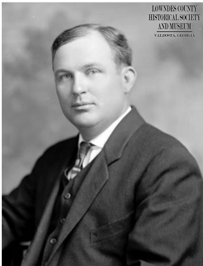
LOWNDES COUNTY HISTORICAL SOCIETY AND MUSEUM VALDOSTA, GEORGIA