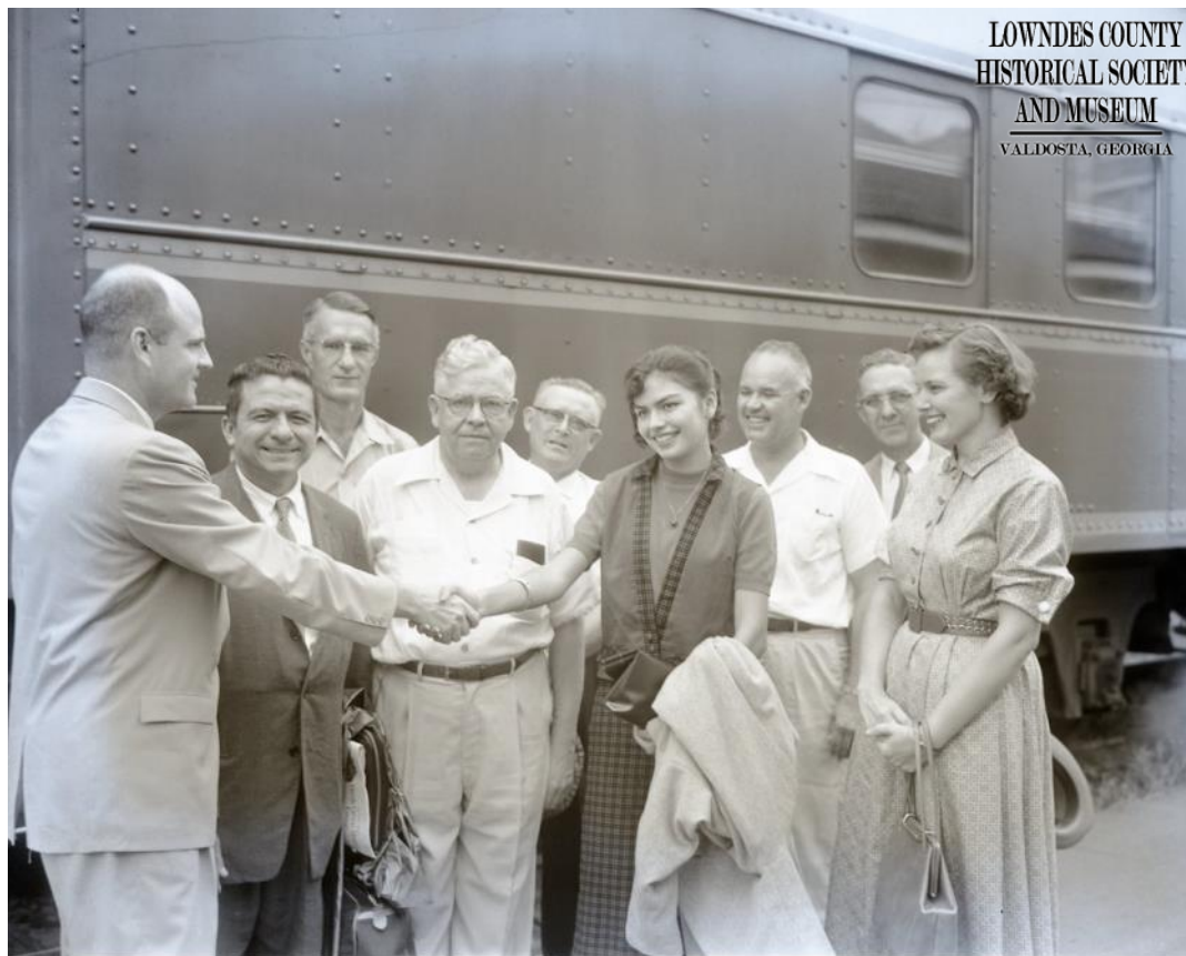
LOWNDES COUNTY HISTORICAL SOCIETY AND MUSEUM VALDOSTA, GEORGIA