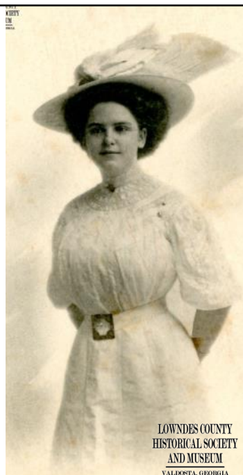
LOWNDES COUNTY HISTORICAL SOCIETY AND MUSEUM VALDOSTA, GEORGIA

They were on Atlantic when the Titanic sank