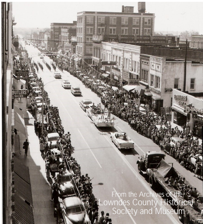
From the Archives of the Lowndes County Historical Society and Museum

The images in this collection cover many aspects of community: Athletics especially golf at Valdosta Country Club and youth football; parades; demolition of structures; police department; the 1895 City Hall and demolition of same; street paving; public utilities; city trucks; vehicle accidents; restaurants; friends; 1958 snow and more. Example Below: A parade on Patterson Street looking south, taken from the McKey building.