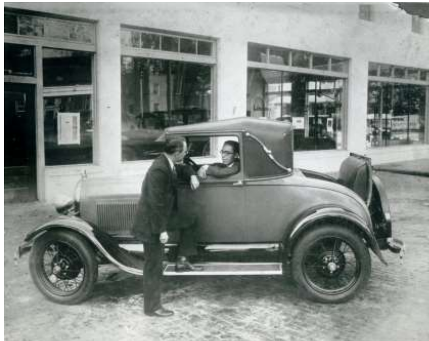
Photo below: 108 W. Central Avenue, Blackburn Studio was on the right side, now part of the First United Methodist campus. This building is immediately west of the alley, and Mo's Mediterranean Table, formerly the King's Grill location. The paper reports that Blackburn invited Ford to step across the street for his photo session.

Photo page bottom: Current Laws Furniture, West Motor Company in 1923.