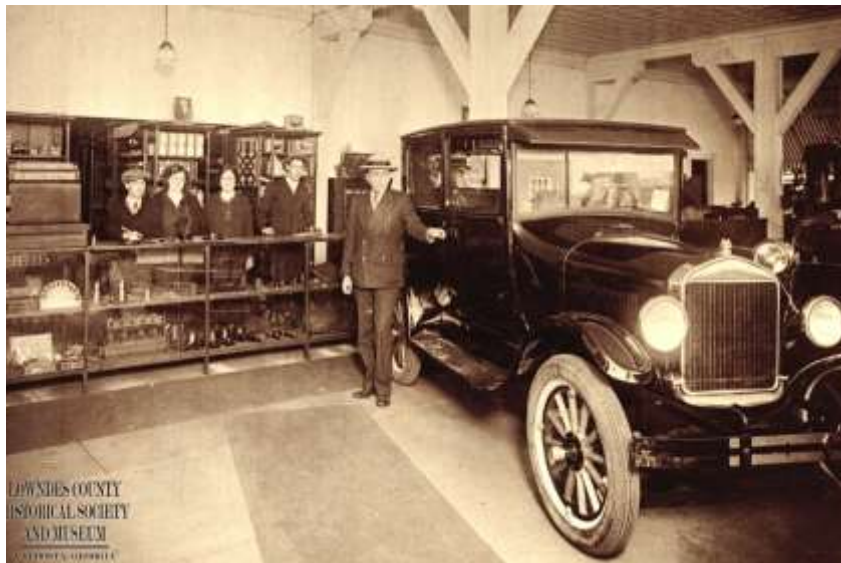
LOWNDES COUNTY HISTORICAL SOCIETY AND MUSEUM COLUMBIAN, GEORGIA

The Ford Dealership, West Motor Company, appears to be the location where most of the interaction with Henry Ford occurred. The business address was 123-129 West Central Avenue, now Laws Furniture.